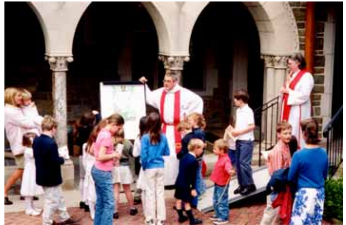
Children gather around a picture of the Resurrection at their Good Friday service.