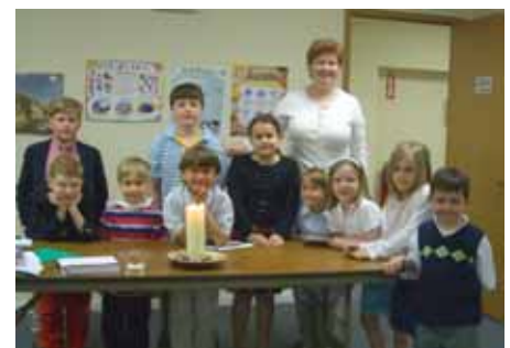
The Children and Communion class