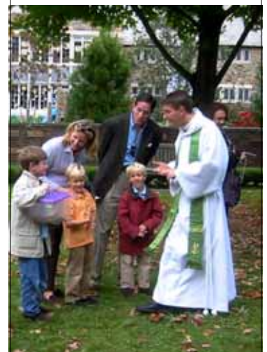
The Blessing of the Animals, October, 2004