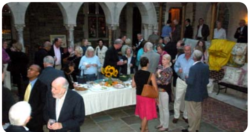
Fair Preview Cocktail Party