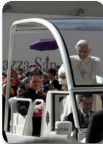
Pope Benedict XVI at the Audience