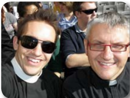
At the Papal Audience in St. Peter's Square