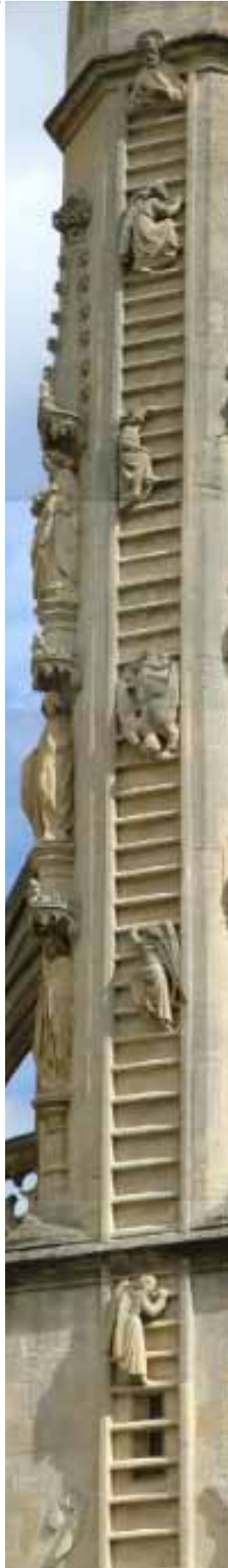
The Abbey Church of Saint Peter and Saint Paul, Bath