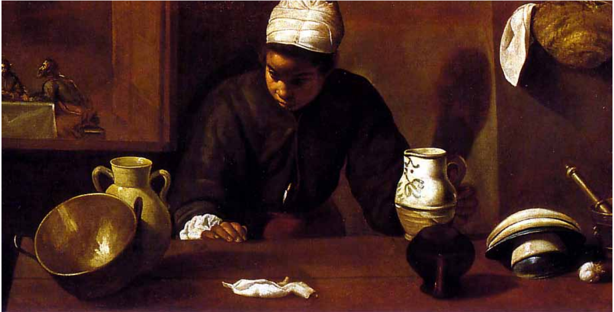
THE SERVANT-GIRL AT EMMAUS (A PAINTING BY VALASQUEZ)